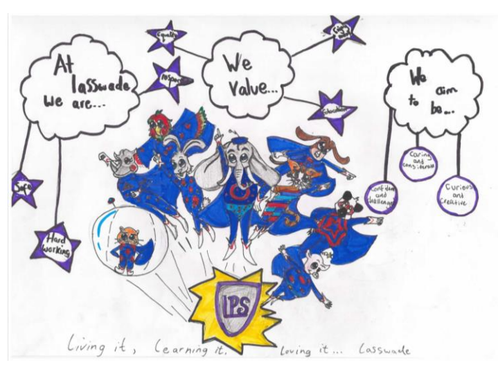
LASSWADE PRIMARY SCHOOL PRIORITIES

Raising Attainment to Ensure all Children and Young People in Midlothian Achieve Outcomes that Lead to Positive Destinations: Learning & Teaching, Curriculum, Equity