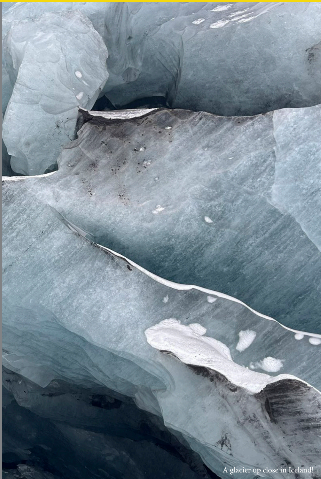
A glacier up close in Iceland!