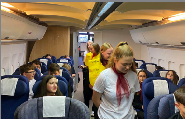
Cabin Crew Experience