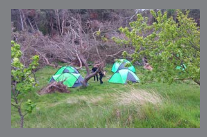
Bronze DofE 3