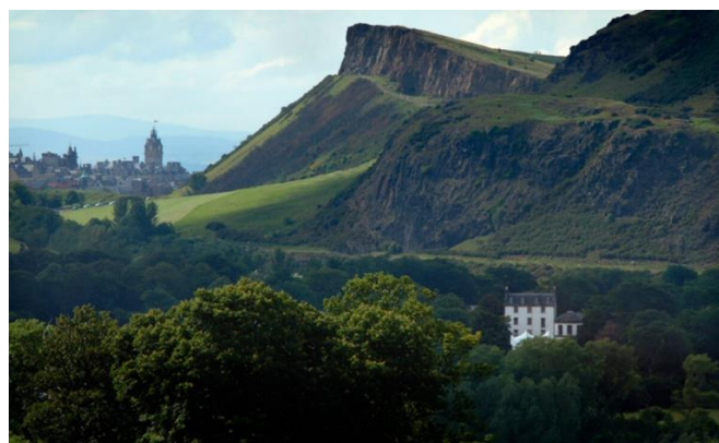
The beautiful location of Teddy Bear's hotel in Edinburgh

Teddy Bear stayed in a beautiful historic hotel in Edinburgh called Prestonfield House. He told me about the magnificent views all around his hotel but he also told me it rained everyday he was there.