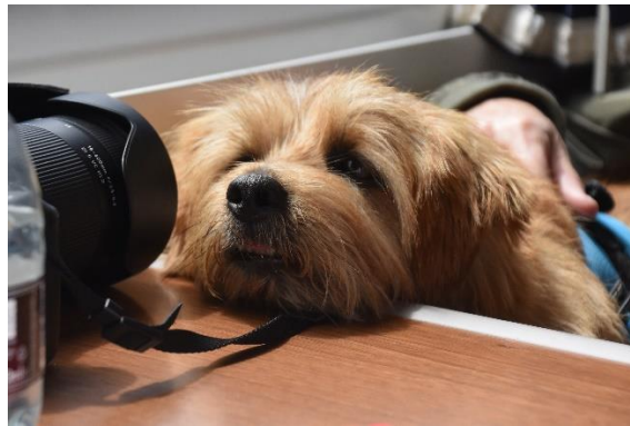
Teddy Bear taking a selfie on the train to Edinburgh

Can you imagine how many fire engines and firemen might have been needed to put out a volcano? Far too many I am sure but Teddy Bear explained your volcano last erupted around 340 million years ago so is most unlikely to ever erupt again.