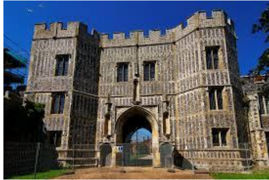
The gateway to St. Osyth Priory

Imagine, they were being built at much the same time!