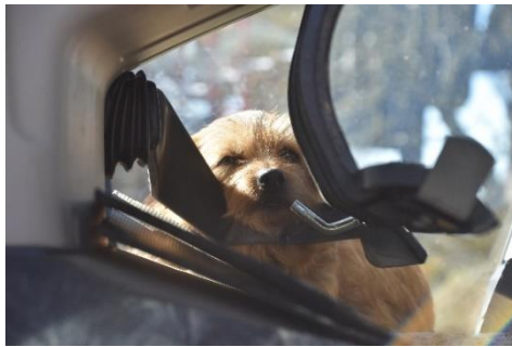
Zippy nearly asleep on the job!

As you now all know my name is Bentley Bear and I am the naughty Toosey living here in Tooseyland. Like you I am very young and keen and eager to learn new things every day. In fact, I make it my goal to learn something new every day, so when I was called to help on the farm yesterday, I forgot all about being naughty and leapt straight into action.