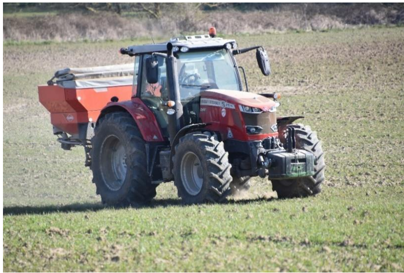
Spinning fertiliser on the reservoir field

First you get to ride on a seat very high up and second the sheer size of this machine is unbelievable. It feels like it might runaway with me at any moment!