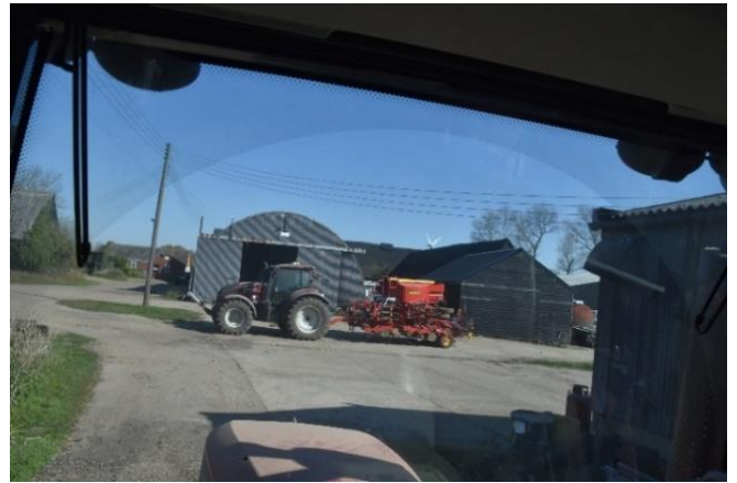
Hang on tight, we are turning a corner

I was told this was the easiest tractor to drive for my first lesson but I think it must surely be one of the most difficult for I did not find it easy to remember everything I was being told.