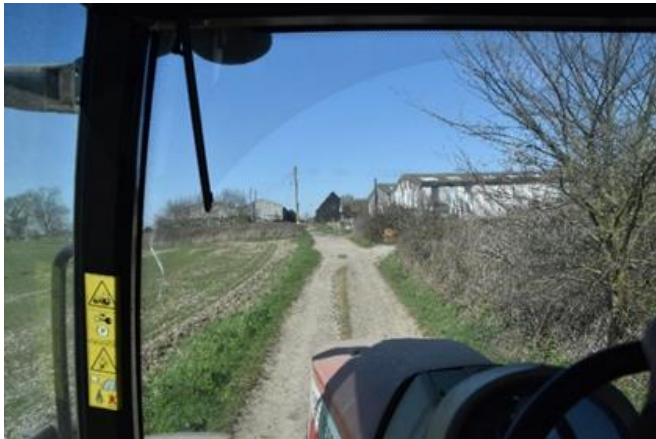
Heading back to the farmyard