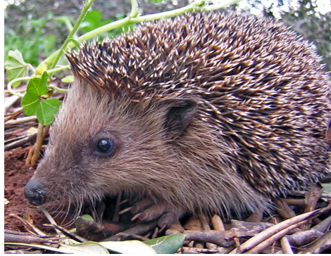
hed dge hog